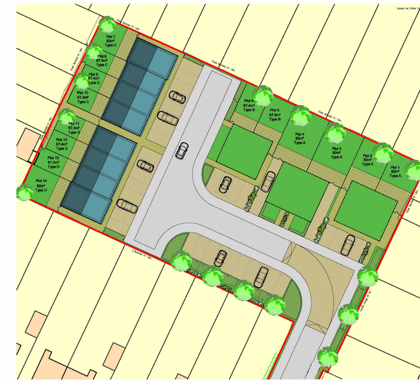
Site / Key Plan 1:500