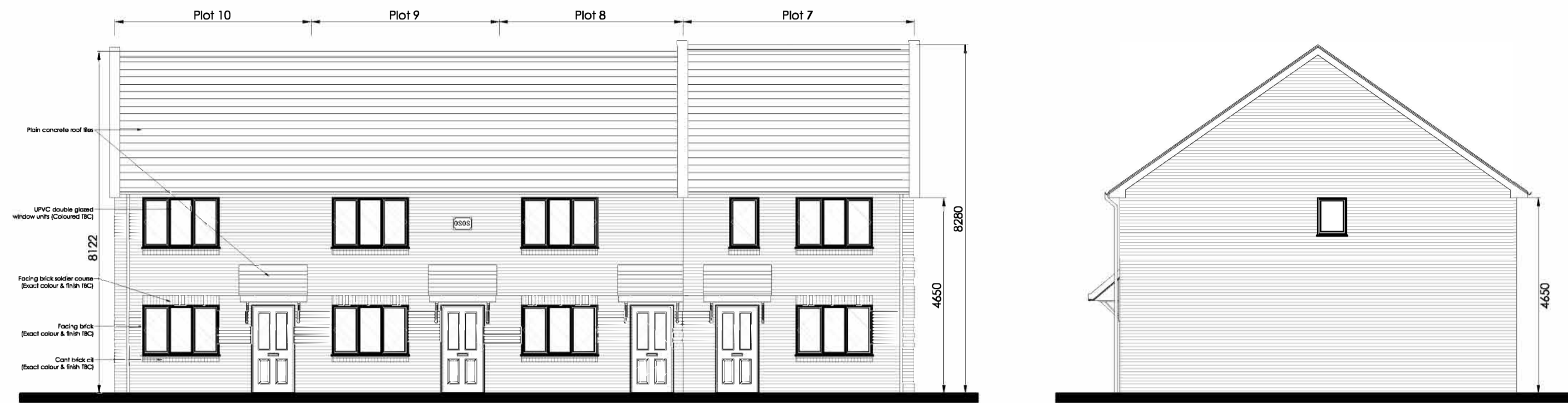
Front & Side Elevations