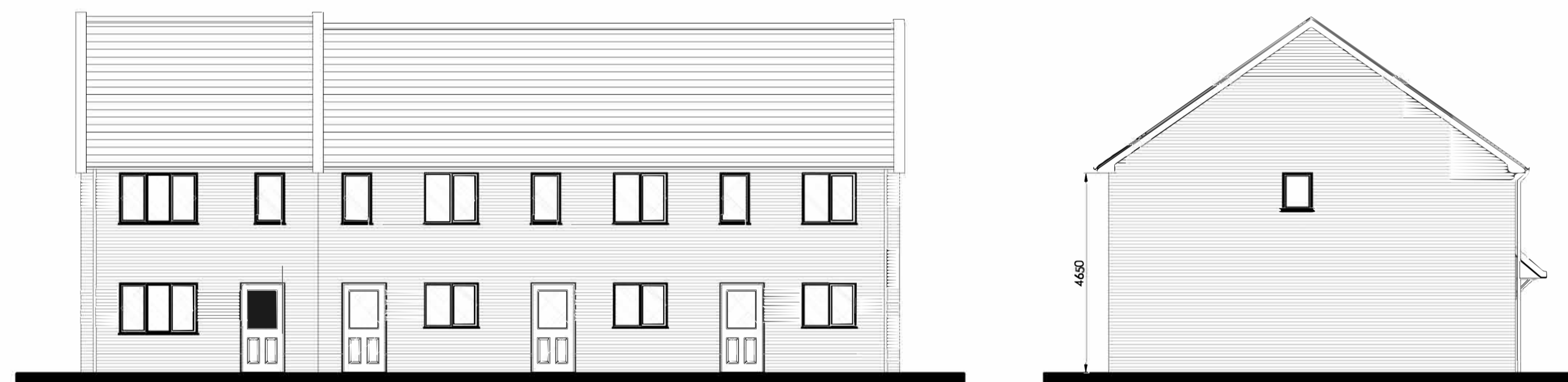
Rear & Side Elevations